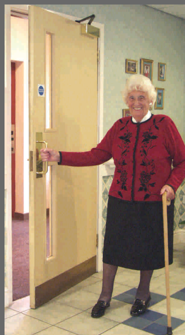
The closer used on this door is an Arrow 325 variable power model.

Independence is important to those facing physical challenges. Careful selection of door closers and associated hardware on fire doors can make a real difference.